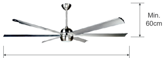
Diameter between 1.52m & 2.44m