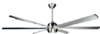
12W LED light